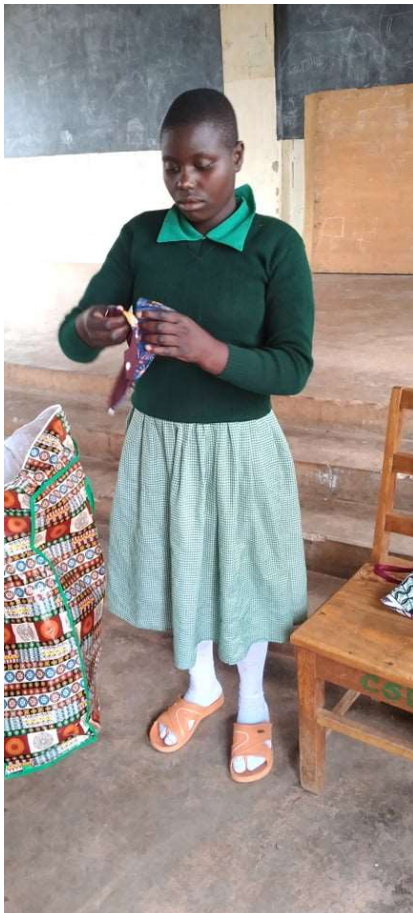
Student receiving her Days for Girls Kit