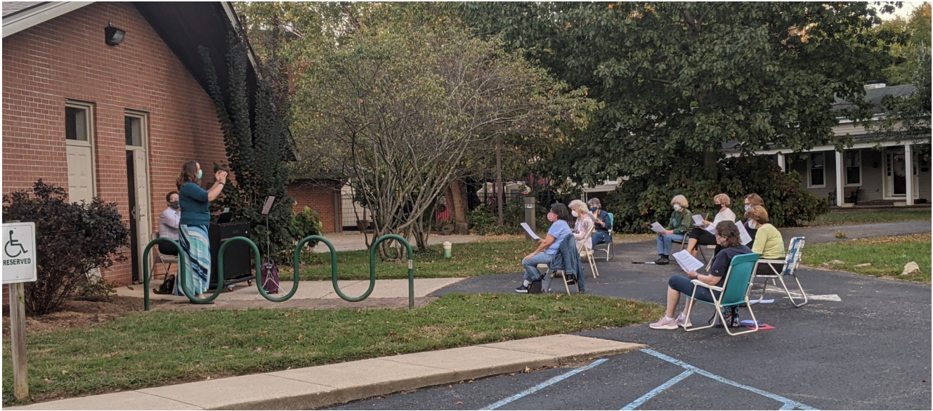
The choir rehearsing while social distancing. Hang in there!

Create some excitement in your life! The Cabin Fever Service Auction is just what you need! We're going online this year to celebrate our favorite annual event. Bidding will be open from January 31 through February 7. You can add your contributions in January. So, get creative and come up with some great items for auction. Events are iffy, but food, treasured items, fun themed baskets, and delivered meals are some ideas. Details to follow as the event gets closer. Help us make the church's biggest annual fundraiser a grand success!